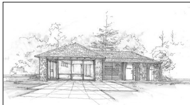
Drawing of new shelter in Greenwood Park.

City staff recently announced that the open air shelter in Greenwood Park will be transformed to a new enclosed rental shelter. According to the city, there are currently nine other enclosed shelters in the park system that are near full capacity. Unfortunately the wading pool near this shelter will be closed for the summer to protect park patrons in and around the construction site.