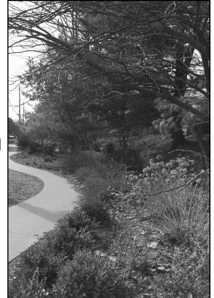
The gardens at Ingersoll and Polk, ready for spring cleanup.