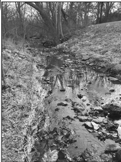
Waveland Trail creek looking south from Pleasant Drive.

Then as part of their "Mission to the City," a crew of volunteers from Walnut Creek Church will be teaming up with Waterbury Neighbors to clean up trash along the small creek that runs next to the Waveland Trail from the point where it flows under I-235 to where it empties into Walnut Creek. The group will meet at the bridge on Pleasant Drive on Saturday, May 24, ready to start at 9 a.m. In addition, we plan to mulch the trees that have been planted over the last few years in the oak savannah area on the old entrance ramp at 56th St. and Pleasant Drive.