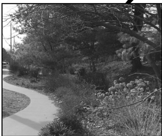
It's Garden Cleanup Time!

Waterbury Neighborhood Association P.O. Box 12054 Des Moines, IA 50312