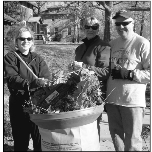
You too can have fun like these Waterbury neighbors during spring cleanup!

No experience is required. And participation offers the opportunity to meet new neighbors, share and gain gardening experience, get fresh air and exercise and take pride in being a part of the Waterbury neighborhood. This year we'll likely be spreading mulch also to decrease our watering needs.