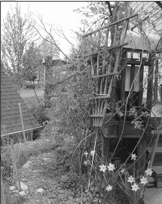
A "wisescaped" yard and garden

For more information, contact Barb Andersen at (515) 279-0081.