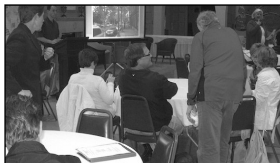
Many Waterbury neighbors attended the WNA Annual Meeting, which featured a presentation on the value of trees to homeowners.